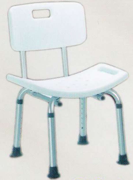
Bath Bench With Back Shown