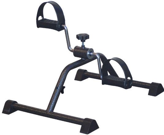
REF. 10270SV Shown Exercise Peddler