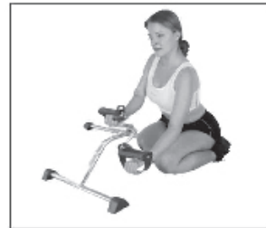
HAND ROWING EXERCISE